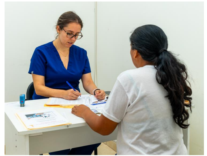
Laran (6), Pisco (6), Tambo de Mora (6), Asia (3), Chavin (3), Huancavelica (2), Lima (2) and San Juan de Yanac (1).

By the site of procedence, in descending order, patients came from Chincha